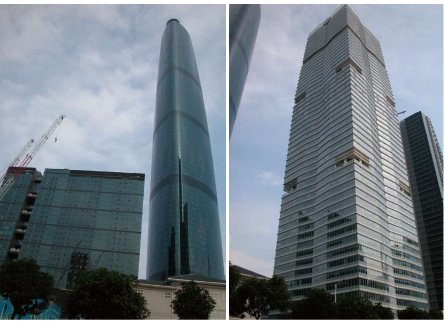
Guangzhou IFC 103-storey Grade A office building Architects: Wilkinson Eyre Architects/ Ove Arup & Partners Hong Kong Ltd