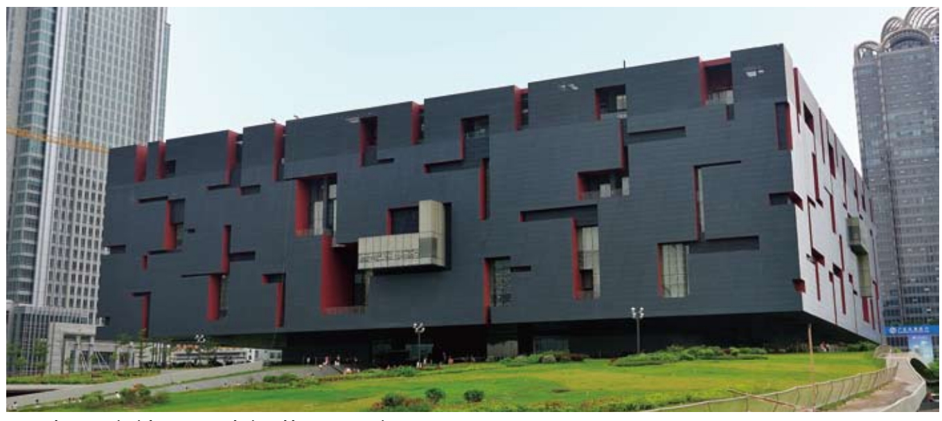
Guangdong Provincial Museum – designed by Rocco Design

For more photos, please visit our online Photo Library www.building.hk/plibrary