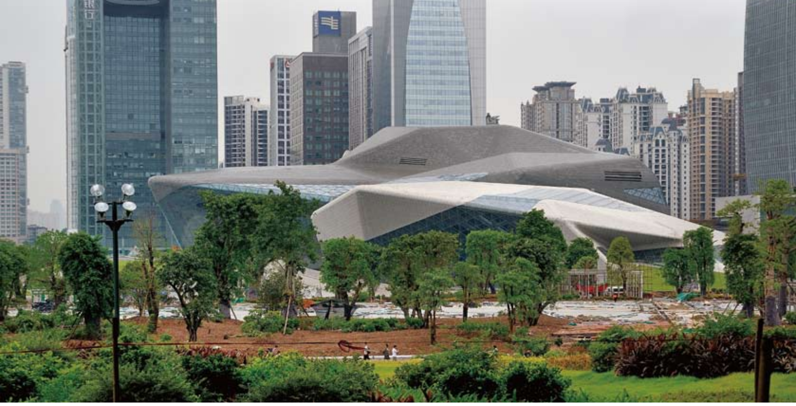
The Guangzhou Opera House at Zhujiang New Town – designed by Zaha Hadid Architects

In preparation to host the 16th Asian Games, Guangzhou has gone through a major transformation in building development. In this issue, BUILDING JOURNAL presents in a photo essay, some of the newly completed projects in Er Sha Island and Zhujiang New Town, which are symbolic of the new faces of Guangzhou.