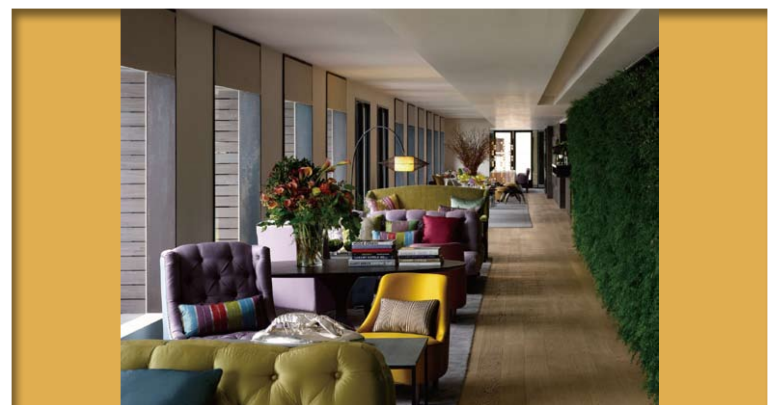
Lounge and Vertical Green Garden