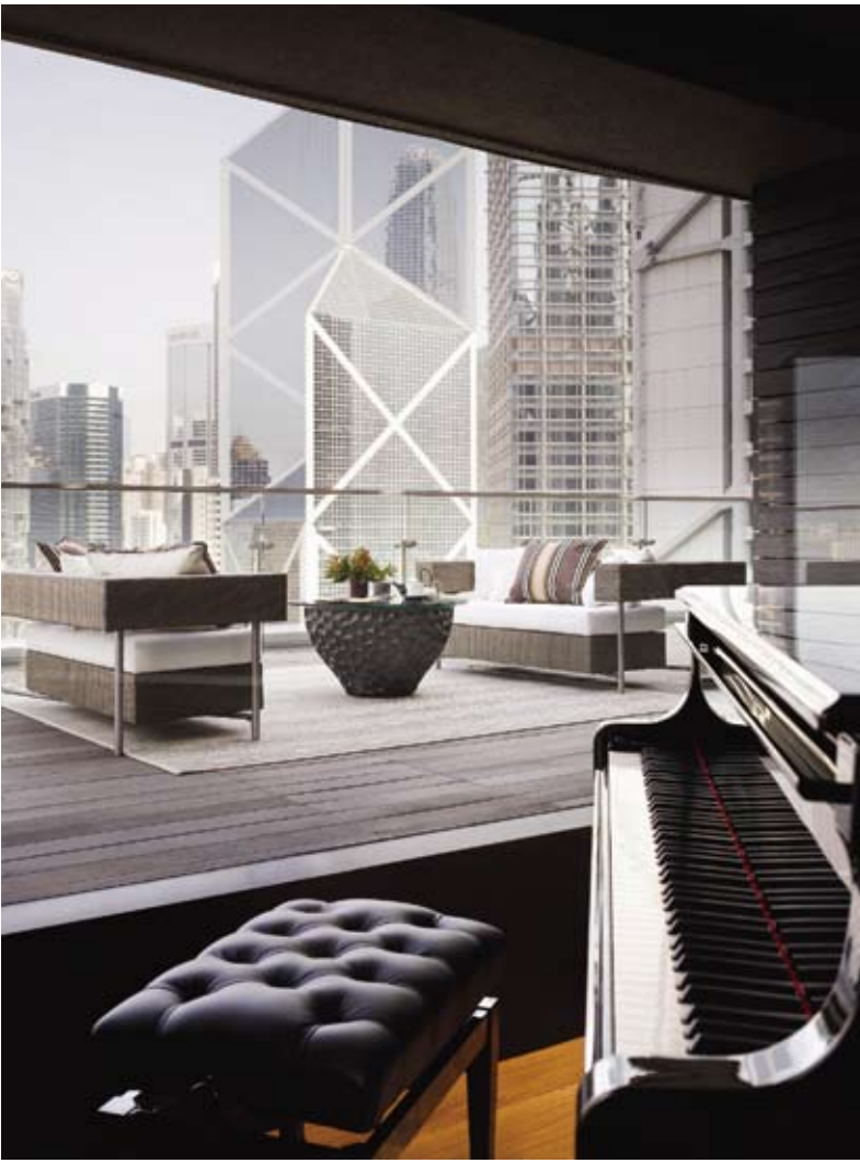
Harbour Side and its Baby Grand

Harbourside whispers "easy glam" in shades of ebony, ivory and warm buttercup yellow. With an unique domed ceiling designed by Australian lighting artist, Ruth McDermott, a baby grand piano and casual seating the mood here is warm and relaxing. The menu completes this vibe with a combination of hearty international home favourites made with top quality ingredients.