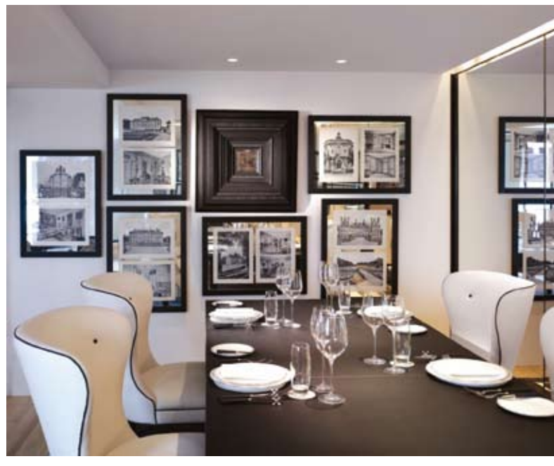
Private Seating Area at Harbour Side

The Terrace, which overlooks the entire panorama of Hong Kong's skyline, promises to be the best "chill out" zone in Hong Kong. Comfortable outdoor lounge seating makes you feel right at home.