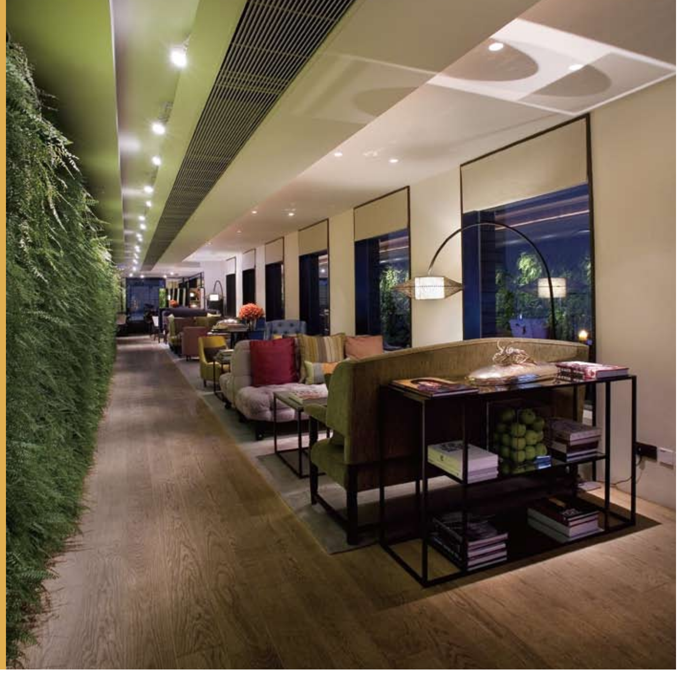
Hallway to the Lounge

mixes masculine with feminine, everyday with ceremonial, industrial with refined and casual with formal.