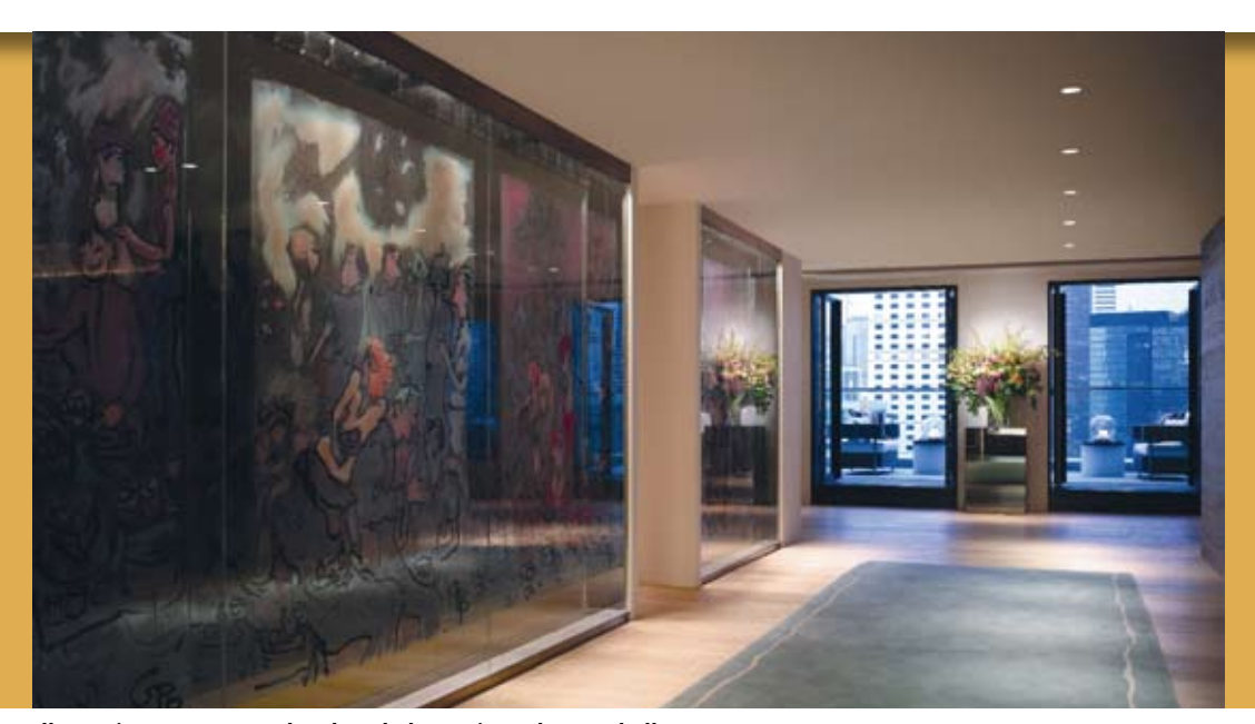
Illustrations screen on glass by Gladys Perint Palmer at hallway