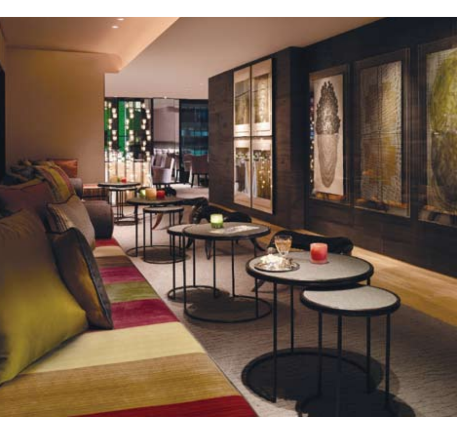
Taste Bar Lounge

The "Easy Glam" ambience throughout reflects Gokson's persona of effortless impeccable style. Her choice of colours and fabulous interior design touches show her vibrant, elegant personality.