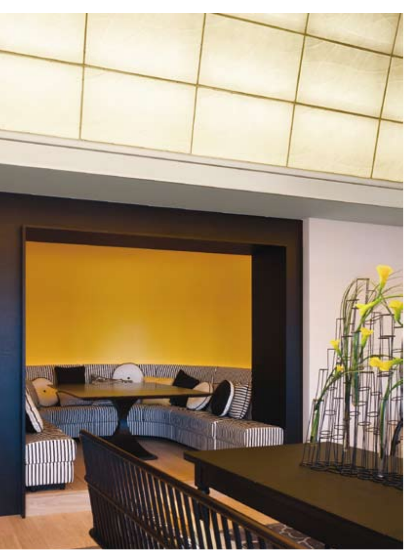
Organic Shaped Buttercup booth at Harbour Side