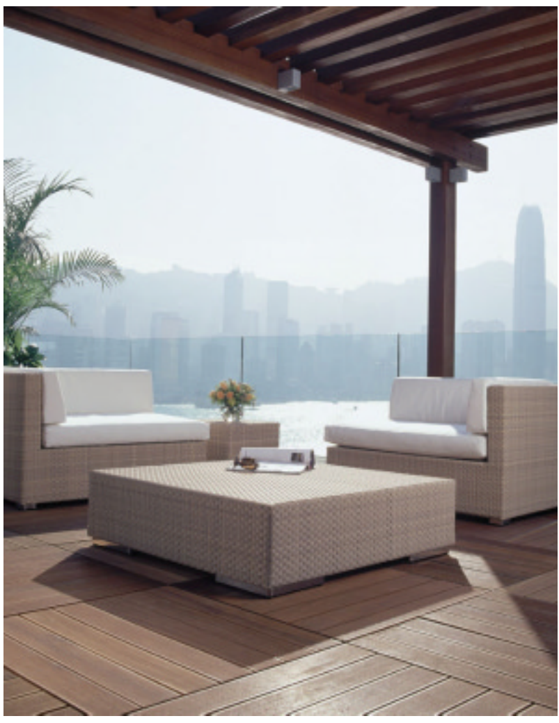
A pergola made of timber trellis provides shade and a cosy overhang for the dining table and lounge area