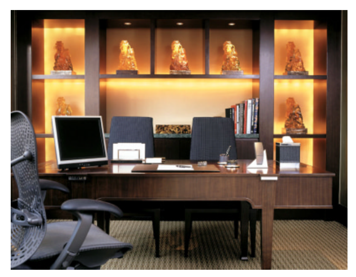
The Study: Custom-designed walnut wood desk and console table