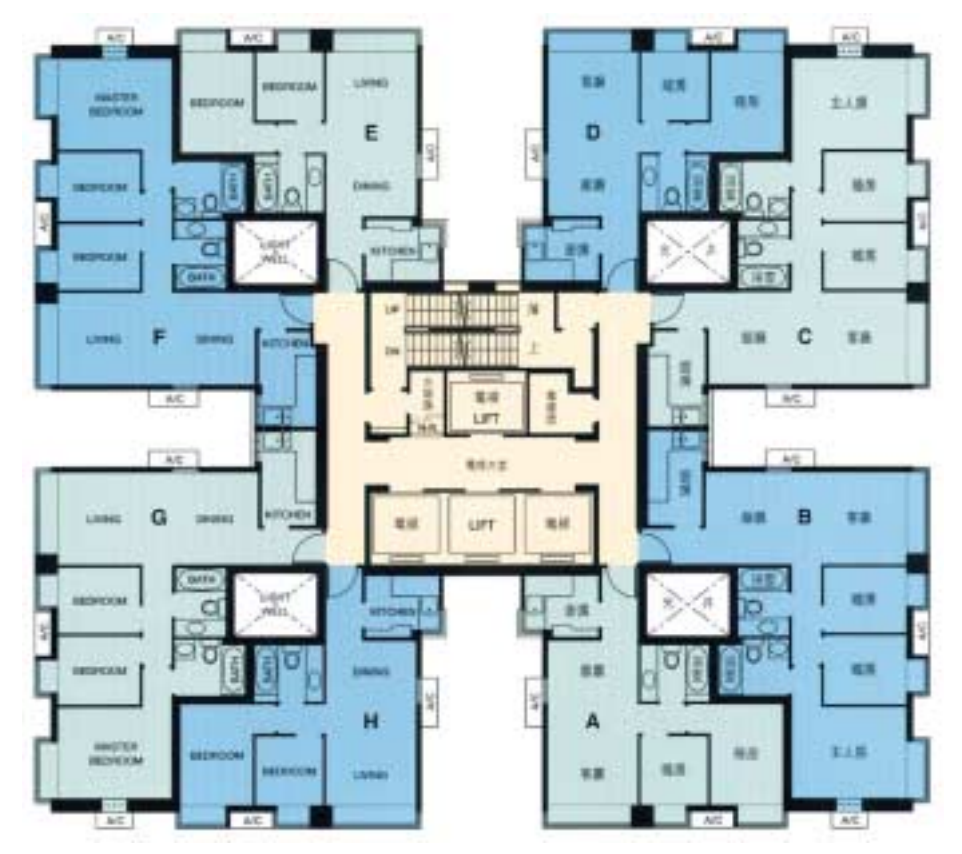
2nd to 53rd floor plan, Towers 5 & 6