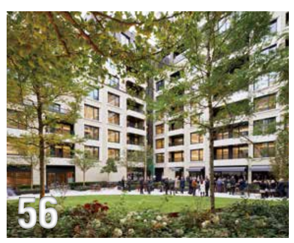
A new oasis off London's Oxford Street