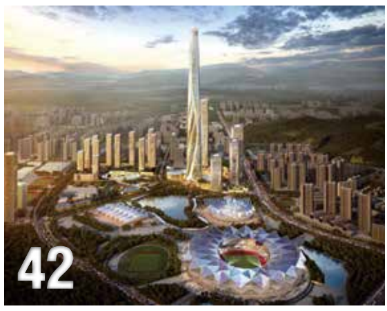
Shimao Shenzhen-Hong Kong International Center commenced construction